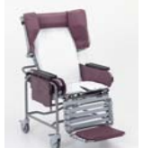
Shown with full padding upgrade