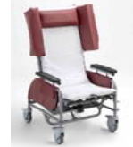
Shown with full padding upgrade