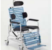
Shown with optional headrest