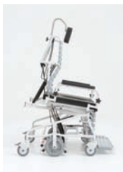
8° Anterior tilt