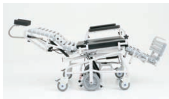
65° Back recline

Width adjustable armrests accommodate widths up to 33"