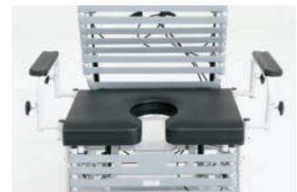
Open front commode seat facilitates peri cleaning

Width adjustable armrests accommodate widths up to 33"