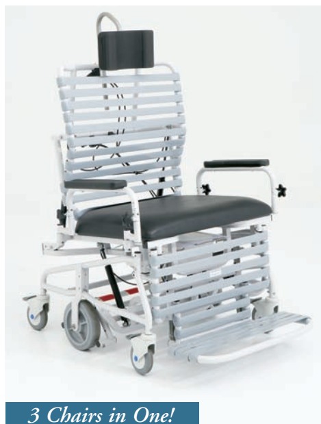
3 Chairs in One!