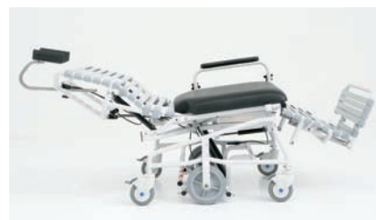
Removable arms assist with side transfers

Infinite positioning options and easy maneuverability make the Bari 385 excellent for patient transport within a facility.