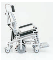
14° Posterior tilt