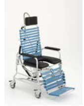
Shown with optional headrest