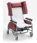
Shown with full padding upgrade