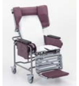
Shown with full padding upgrade