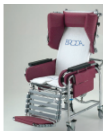
Good for general resident seating (full padding upgrade shown)