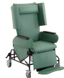
Ideal for multiple users and hospital environments