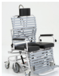
Available with transport seat