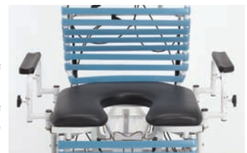
Open front commode seat facilitates peri cleaning

Width adjustable armrests accommodate widths up to 33"