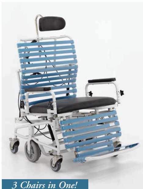
3 Chairs in One!