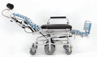
Removable arms assist with side transfers

Infinite positioning options and easy maneuverability make the Bari 385 excellent for patient transport within a facility.