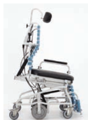
8° Anterior tilt