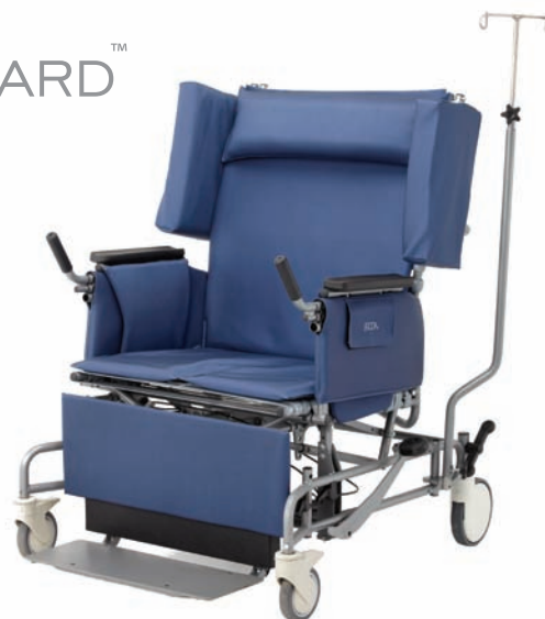
Vanguard with IV pole and vinyl seat and back pad upgrade.